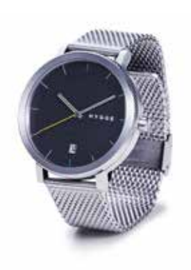
MSM2203C(CH) Silver & Black

The Hygge 2203 series consists of five models: 44mm case with a Japanese quartz movement and calendar function, set with a diamond cut pattern bezel, double-layer dial and two versions of band in leather and Stainless Steel. A watch for men passionate about beautiful design and high-quality craftsmanship!