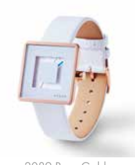
2089 Rose Gold white