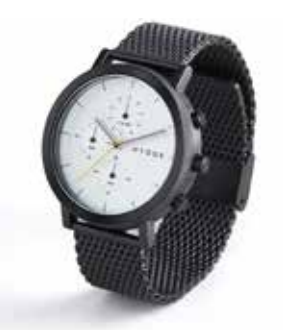
MSM2204BC(CH) Silver & Black

Preserving the essence of Scandinavian modern design, the 2204 chronograph series is nonetheless a tribute to the brand and its past collections with the minimal use of colors and a yellow touch. The 2204 watches come in five models with different band materials, case and dial's colors.