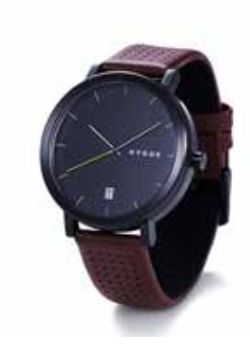
MSL2203BC(BO) Black & Bordeaux

Movement Functions Case Case dimensions Water resistance Crystal Bracelet / Strap