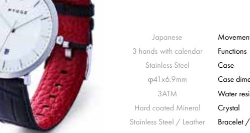
φ41×6.9mm Case dimensions 3ATM Water resistance Hard coated Mineral Crystal Stainless Steel / Leather Bracelet / Strap