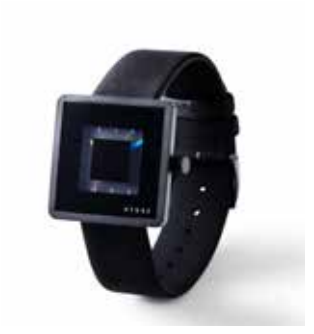
2089 All Black Black

Movement Functions eel Case 5mm Case dimensions Water resistance Crystal Strap