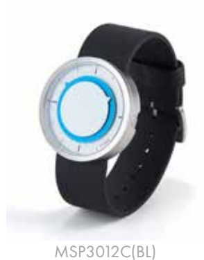
White & Blue