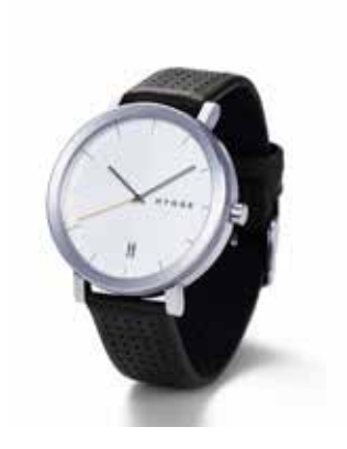
MSL2203C(BK) Silver & Black